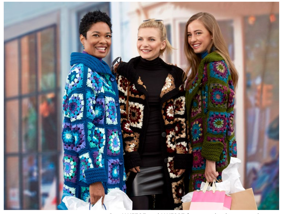
See LW5303 and LW5297 for coats in alternate colorways

See next page Stitch Diagram and alternate photo